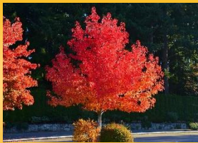
American Sweetgum ( Liquidambar styraciflua )- Yellowish-purple-red; select seedless cultivars.