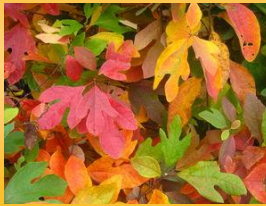
Common Sassafras ( Sassafras albidum )- Shades of yellow to deep orange to scarlet and purple.