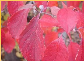
Flowering Dogwood ( Cornus florida )- Red to reddish purple.