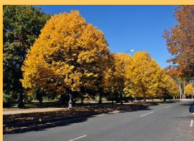
Linden ( Tilia )- Yellow-green to yellowish.