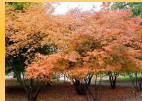
Downy Serviceberry ( Amelanchier arborea )- Yellow-apricot orange.