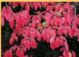
Kousa Dogwood ( Cornus kousa )- Varies from yellow, gold, amber, orange to reddish purple.