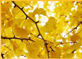
Ginkgo or Maidenhair ( Ginkgo biloba )- Excellent clear yellow.