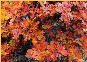
White Oak ( Quercus alba )- Brown to a rich red to wine color.