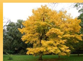
American Yellowwood ( Cladrastis kentuckea )- Yellow tones.