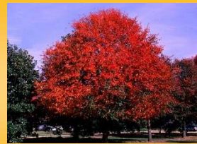
Black Gum ( Nyssa sylvatica )- Yellow to orange to scarlet to purple shades.