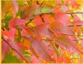
American Hornbeam ( Carpinus caroliniana )- Yellow, orange, red to reddish-purple: varies according to cultivar.