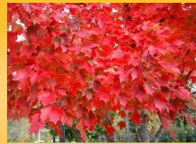
Red Maple ( Acer rubrum )- Colors will vary from red-orange red depending on specific cultivar.