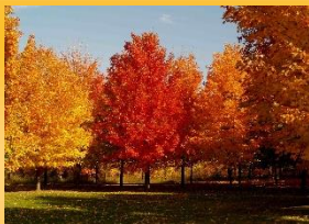
Sugar Maple ( Acer saccharum )- Brilliant yellow, burnt orange to reds.