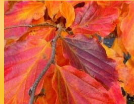
Persian Parrotia or Persian Ironwood ( Parrotia persica )- Brilliant yellow to orange to scarlet-red.