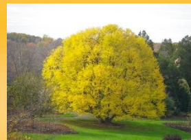
Katsura Tree ( Cercidiphyllum japonicum )- Yellow-soft apricot-orange.