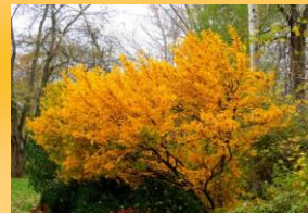
Witchhazel ( Hamamelis species )- Yellow, reds, and purple depending on cultivar.