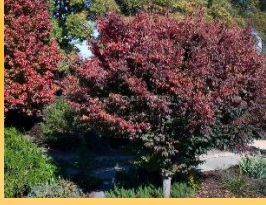
Japanese Zelkova ( Zelkova serrata )- Yellow-orange-bronze to deep reddish purples depending on cultivar.