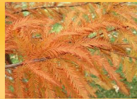
Common Baldcypress ( Taxodium distichum )- Soft brown to orangish-brown.